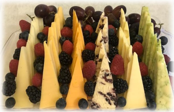
Mini 8" x 12"