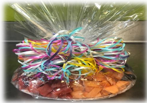
More Than a Mini